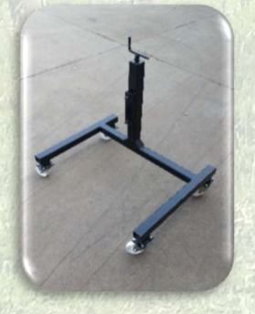
Supporting trestle with wheels