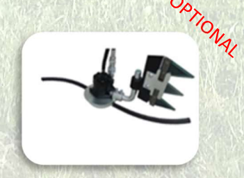
Shoot conveyor for vertical bars