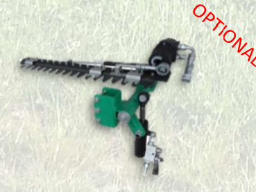
Horizontal bar with mechanic inclination dx