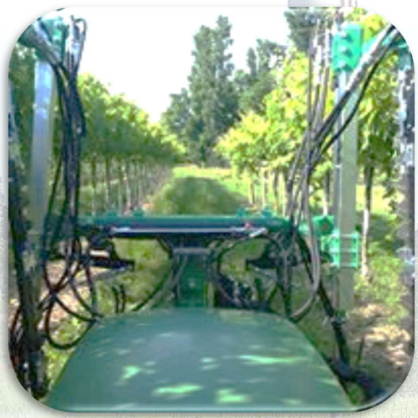
Frame was designed for maximum visibility for the driver of the tractor