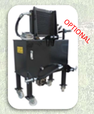
Hydraulic system for tractors