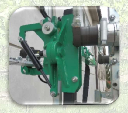
Straddle bar available from 1.80 m or 2.10 m with single-blade or double-blade with anti-