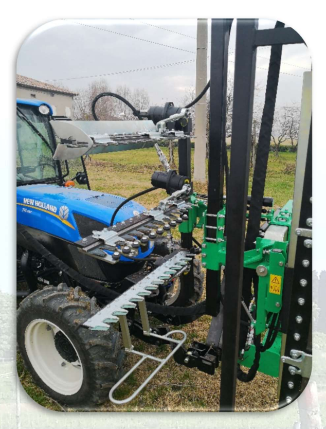
Model CL200 Scavallata adaptable for pruning of single curtain system with selfsharpening single-blade